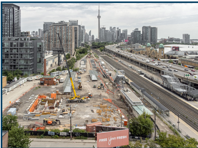
The 10-mile Ontario Line subway project through downtown Toronto.