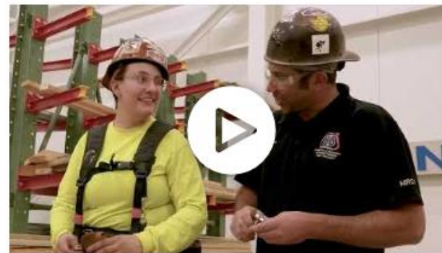
Carpenter & Millwright careers