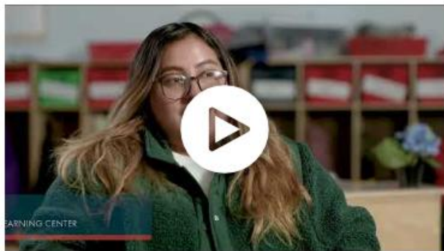
Early Childhood Education careers