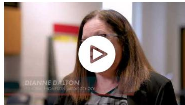
K-12 Education careers